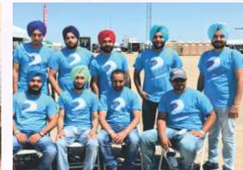
At Lincoln Air Park, USA