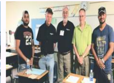
During Design Presentation with FSAE Members